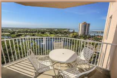
LOVERS KEY RESORT 808