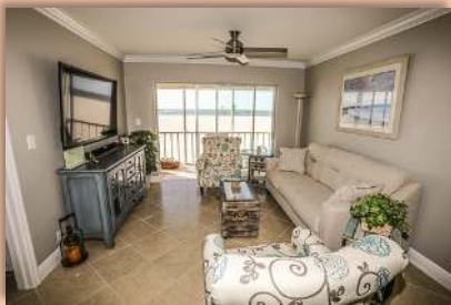
CASTLE BEACH 204