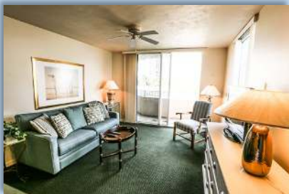
LOVERS KEY RESORT 206