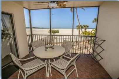
CARLOS POINT 114